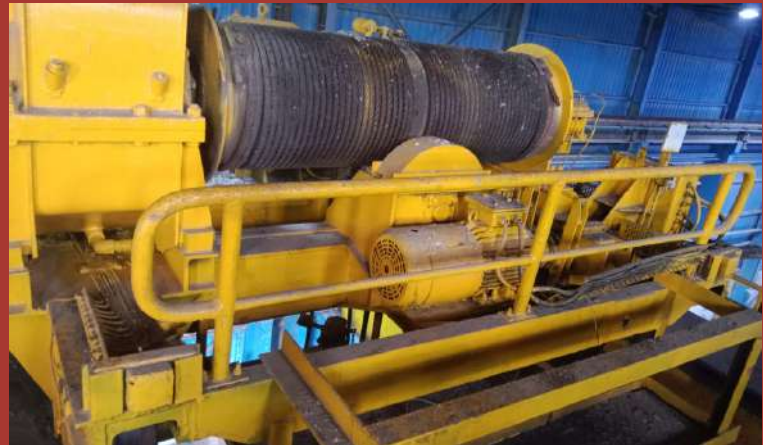
Refurbishment of 20 Ton EOT Crane Trolleys at a Major paper manufacturer in Madhya Pradesh