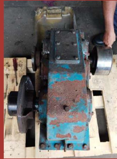
50 Ton EOT Crane Gear Box Overhaul