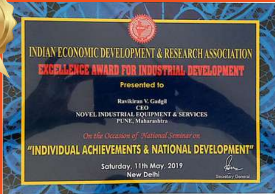
Excellence Award for Industrial Development