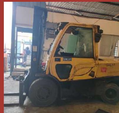
Modification and adoption of Kirloskar Engine in 7 T Hyster Forklift