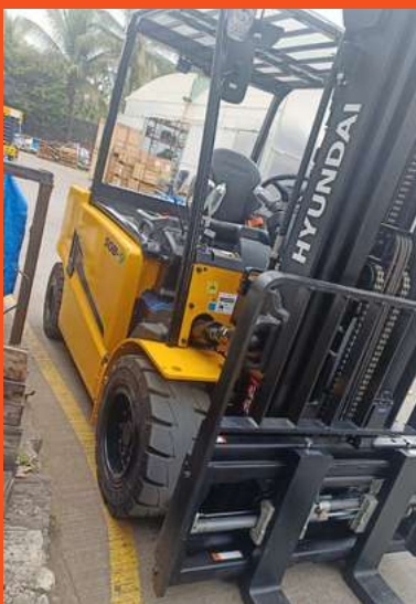
5T Hyundai Battery Forklift delivered to Korean Base Glass Manufacturing Company