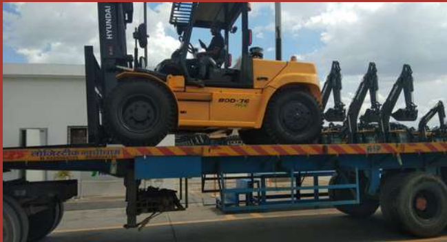
7 T & 8 T Hyundai Diesel Forklifts supplied to a major manufacturer