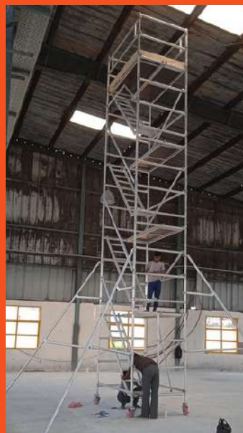
14M working height Scaffolding delivered to major Mud Pump Manufacturer