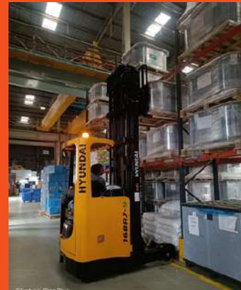
1.6T Reach Truck delivered to renowned Automobile Manufacturer