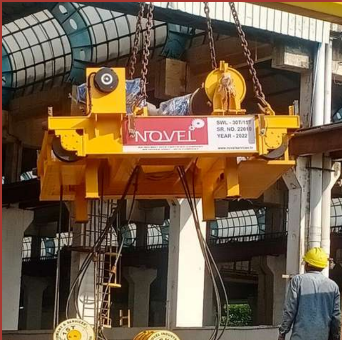
Upgradation / Modification of 30T/15T EOT Crane Complete with Electrical Panel and VFD drive double DC Brakes for all motions and other safety features for L&T Kanchipuram