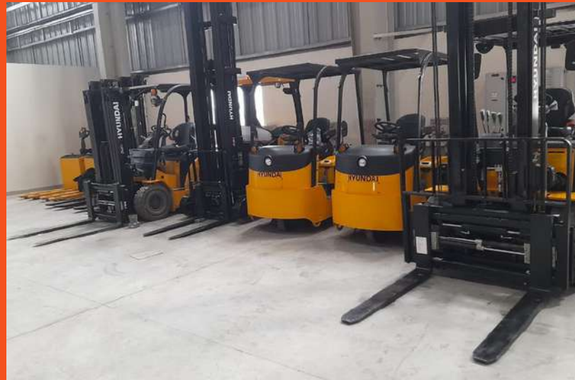
Hyundai make Lithium Ion powered equipment range delivered at a renowned Pump Manufacturer