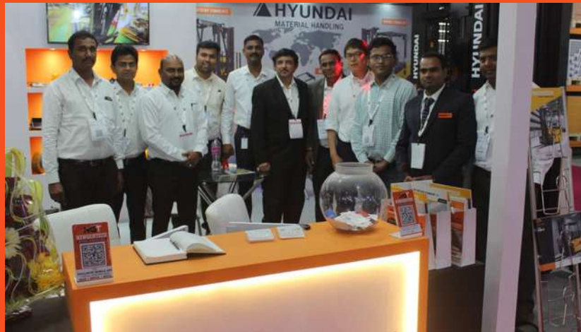
Our Dealer Partner NEWGENTECH at "India Warehousing & Logistic Show" at BOMBAY Exhibition Centre