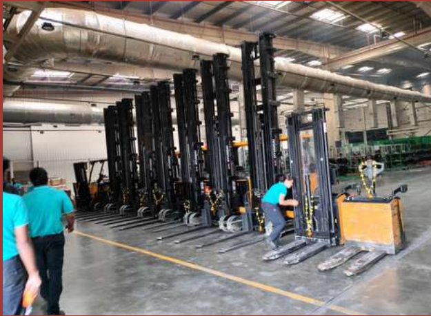
HYUNDAI Forklift Rental Business- Forklift, Reach Truck, BOPT, Stacker at major Tyre Manufacturer