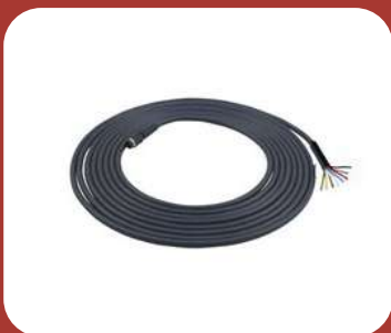
Dynamic Mast Cable

An Import Substitute suitable for use in moving applications. Ex. Camera mounted on a moving arm works best on your Forklifts, Reach truck.