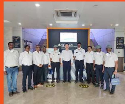
Tata Motors delegates visited Hyundai plant with Novel team