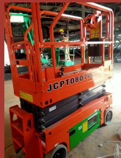
8 Mtr working height Scissor Lift delivered to World Leading Surface Technology Provider