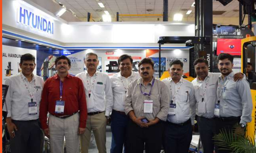
Our Dealer Partner REACH International at "India Warehousing Show 2023" at Pragati Maidan, Delhi

We are participating in the "MAHATech 2024" a Mega Business Event with over 400 participants at Shivajinagar, Pune