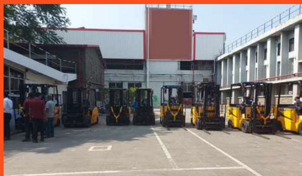
Hyundai Forklift at Major Genset Manufacturer