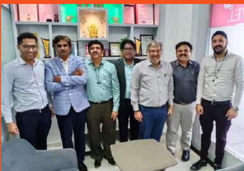
Visit of MT&T Management Team to Novel Head Office