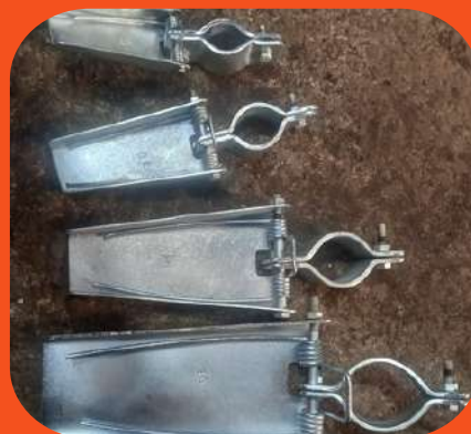
Clamp type EOT Crane Hook Safety Latch

An Import Substitute suitable for use in moving applications. Ex. Camera mounted on a moving arm works best on your Forklifts, Reach truck.