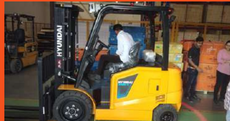
30 BE-X Model Hyundai Battery Forklift (with Fleet Management System) delivered to renowned Automobile Manufacturer